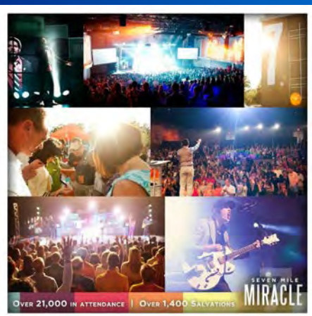
Charlotte, North Carolina's Elevation Church asked Eddy to author and perform a spoken word piece for their 2012 Easter weekend. The weekend included 10 total services with over 21,000 in attendance, and more than 1,400 salvations.