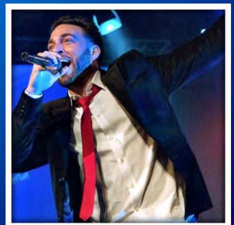
"Music offers such a unique way to connect with people from all walks of life," Puyol said. "I love what I do!"