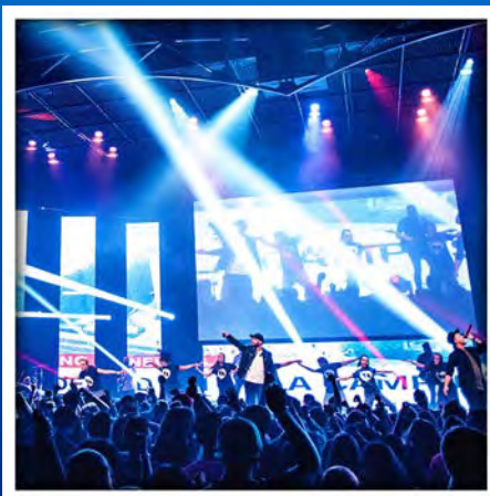
Eddy Puyol is often invited to perform and speak at events like the 12 Conference.